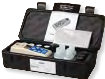
Kit includes standards, sample vials, and a rugged carrying case.