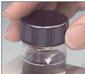
Index markings on the cuvettes make it easy to perform repeatable measurements.

Meter: 7 oz (200 g); Meter with case: 2.75 lb (1.25 kg)