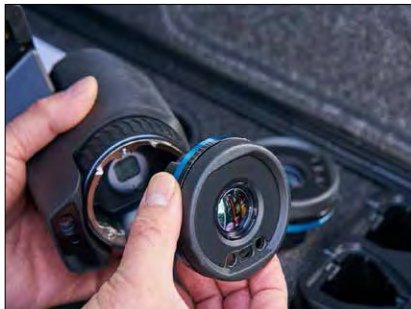
Share lenses (wide angle to telephoto) across your fleet of cameras thanks to AutoCal™ optics