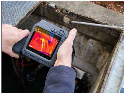
Up to 161,472 pixel resolution for accurate readings on distant targets