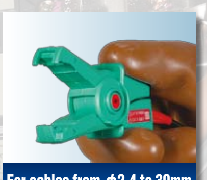
For cables from \phi 2.4 to 30mm