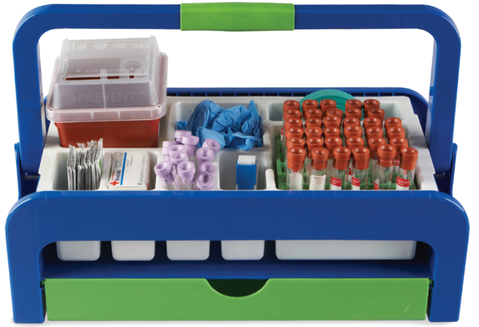
US Patent No.D904026