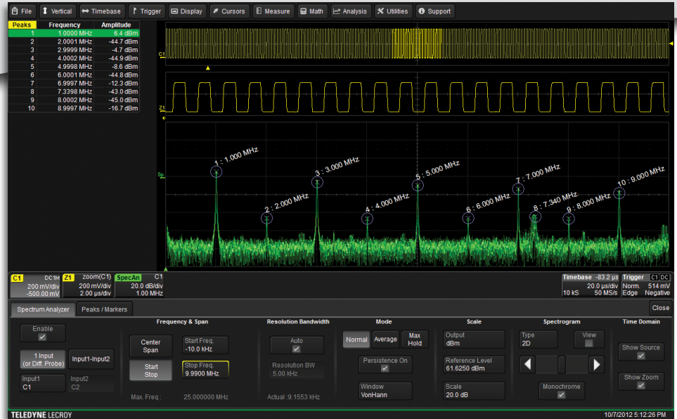
Spectrum analyzer style controls simplify waveform analysis in the frequency domain