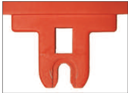
Hot Stick Connection: Shotgun or Universal Spline

The high voltage resistors limit the current through the ground cord to a maximum of less than one milliamp. Although the ground cords are insulated for voltage up to 20kV, they should always be kept free and clear from you and any other conductors.