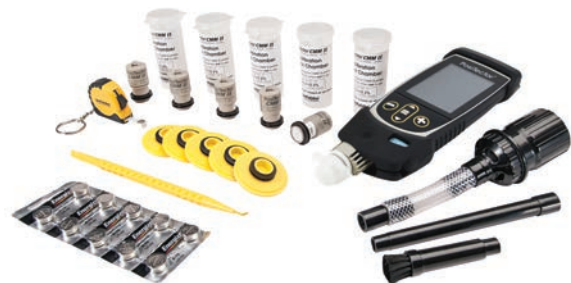
PosiTector CMM IS Pro Kit includes the PosiTector DPM Advanced

Replacement chambers, salt solutions, tools, caps, stackable probe extensions, and fins are available upon request