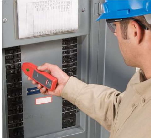
The receiver always finds the right breaker - automatic sensitivity adjustment removes ambiguity from the search by indicating single, correct breaker with light and sound.