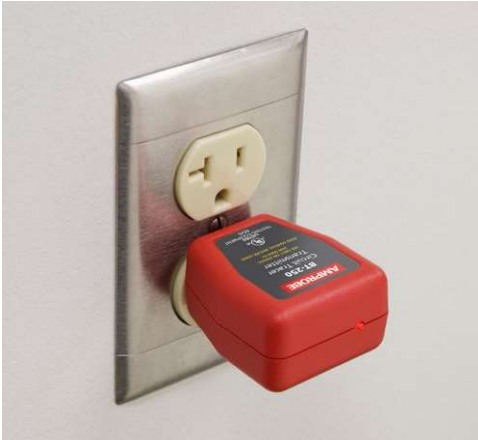
Plug the transmitter into an outlet and receiver will find the corresponding breaker.