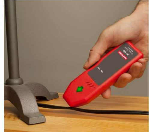
Designed for use in residential and light commercial environments.