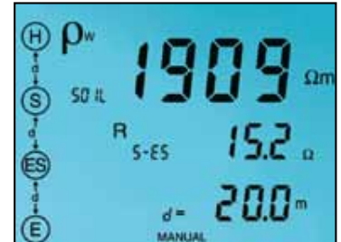
The Wenner test displays test lead connection, soil resistivity ( \rho ) test results, electrode spacing and resistance.