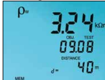
Displays test results stored at a specific memory location as well as the test function.