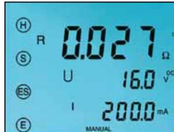
The 4-Point Bond test shows lead connections, bond resistance test results, test voltage and current.