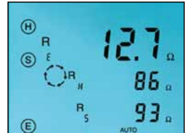
The 3-Point Fall-of-Potential test displays test lead connection, grounding rod resistance and test electrode resistances.