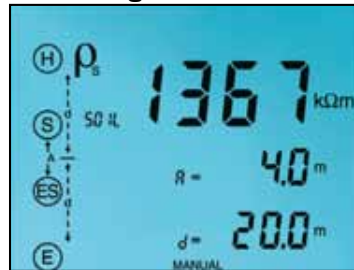
The Schlumberger test displays test lead connection, soil resistivity ( \rho ) test results and electrode spacing.